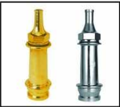
BRANCH PIPE / NOZZLES

Material Gun metal Grade LTB-2, Stainless Steel & Aluminum Size 63 mm, 38 mm dia 12 mm to 20 mm dia for ISI marked Performance Test Hydraulic Test : 21 Kgf/cm 2