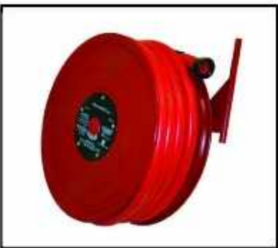
HOSE REEL DRUM

(i) Type "A" Swinging (180° wall mounting) (i) Nozzle IS : 8090-1976 (ii) Hose Reel tubing Hydraulic Rubber Hose IS : 444 -1980 (iii) as per IS : 884/85