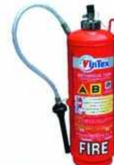
Mechanical Foam (AFFF)