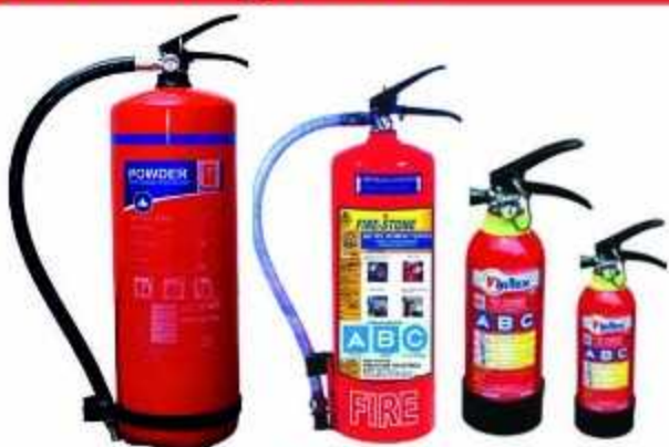
ABC Dry Powder