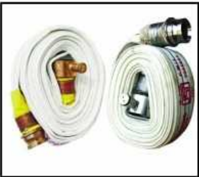
CP FIRE HOSE

Material Canvas/Reinforced Rubber Size 15 Mtr, 22.5 Mtr, 30 Mtr